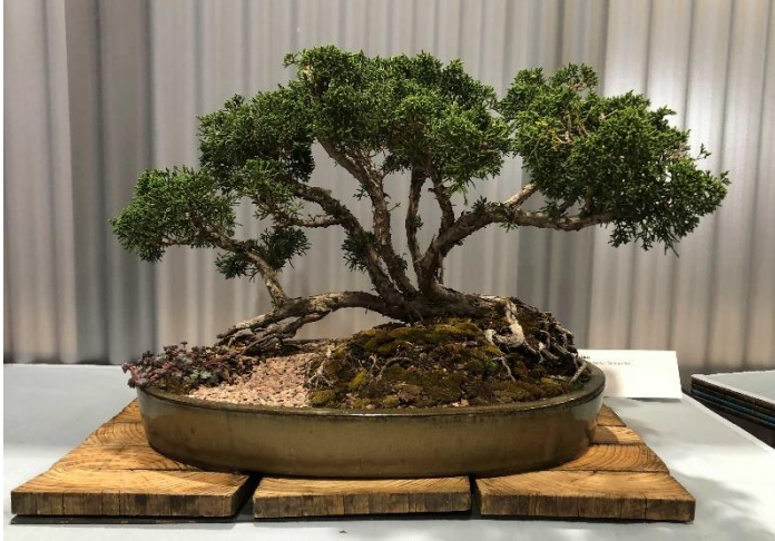
Left: another shimpaku as raft style arching across a creek.