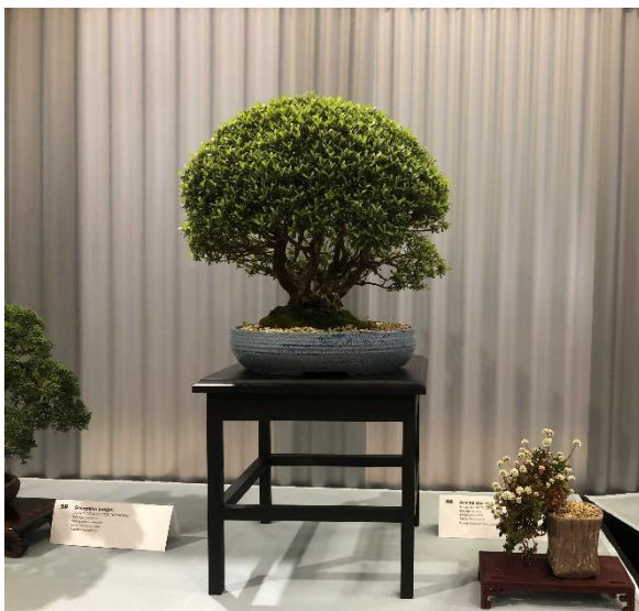
Left: Azalea 'Saotome'

Here's a couple of photos from the display trees