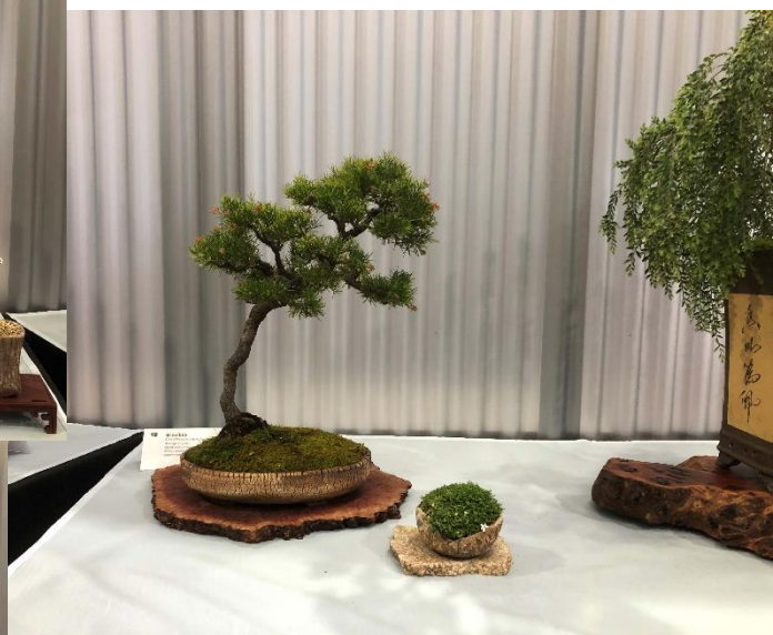
Below: Grevillea rosemarinifolia