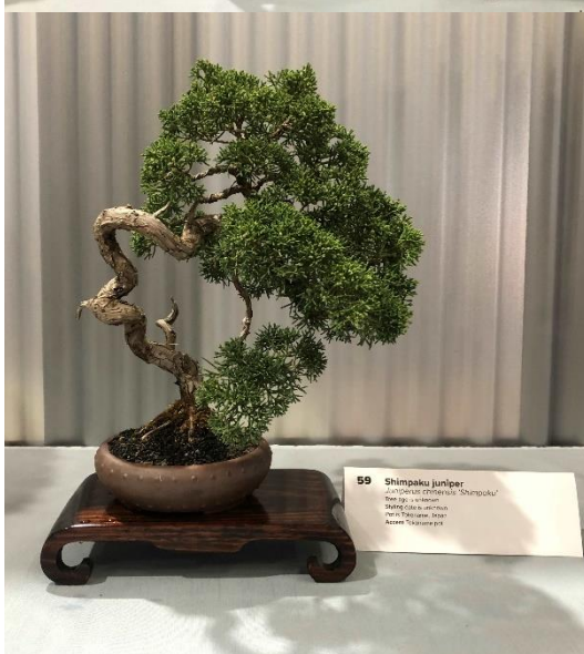
Left: Juniper 'Shimpaku'